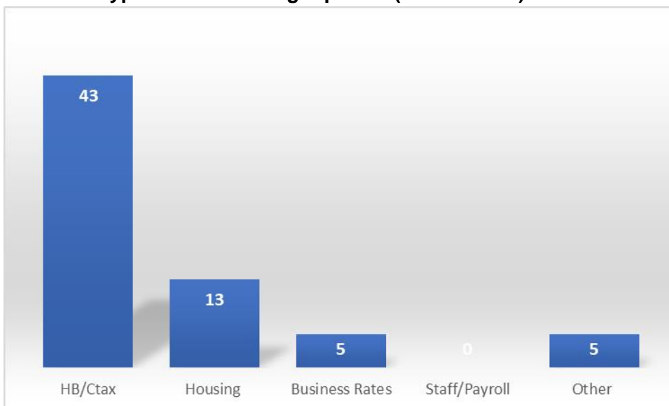
Table 1. Types of fraud being reported (66 Referrals)

'HB/CTax- Housing Benefit/Council Tax Reduction Scheme/ Single Person Discounts.