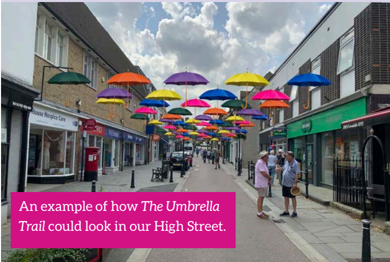
An example of how The Umbrella Trail could look in our High Street.