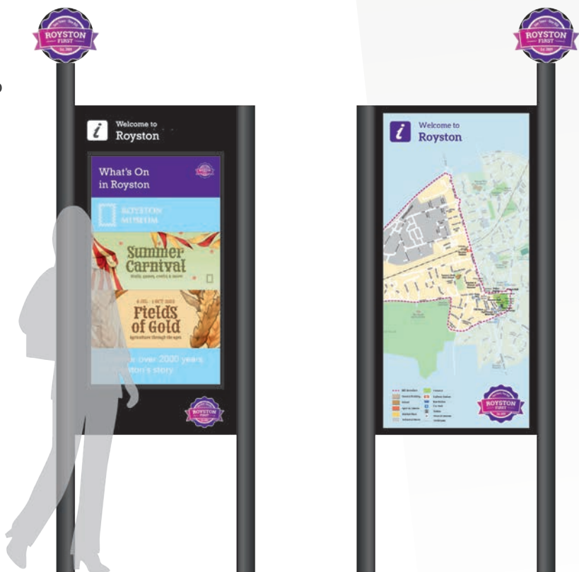
Proposed new digital signage

To introduce new digital signage in the town, giving all members access to free advertising to promote their goods and services.