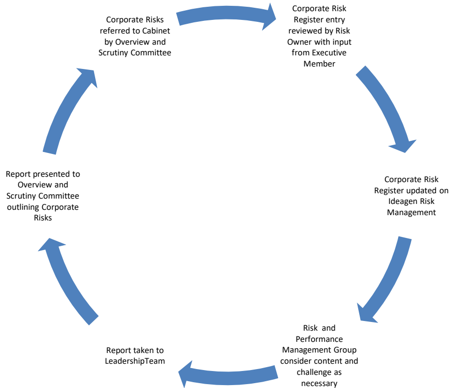
Diagram representing the review of Corporate Risks